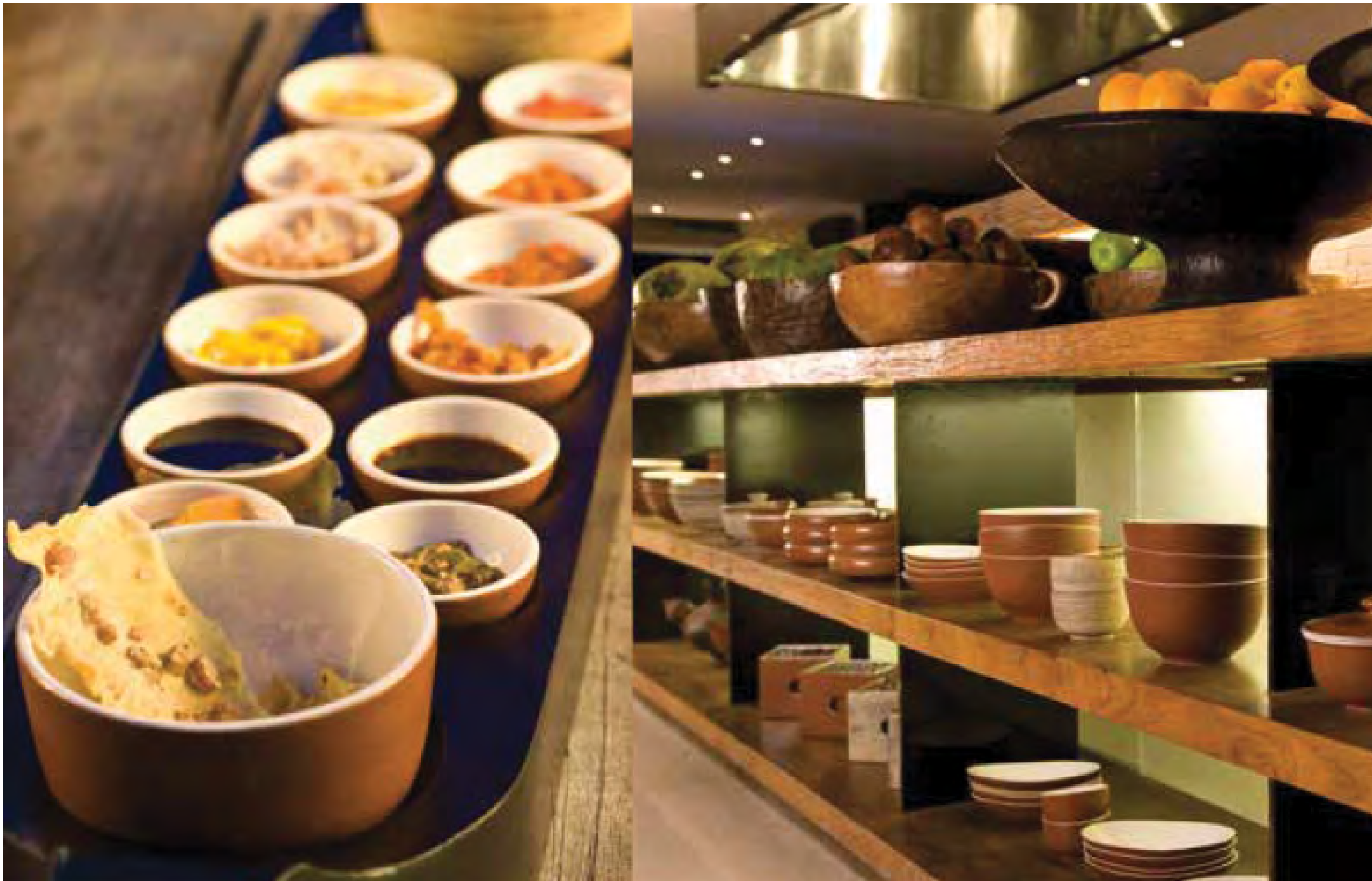
ALILA VILLAS ULUWATU - BALI