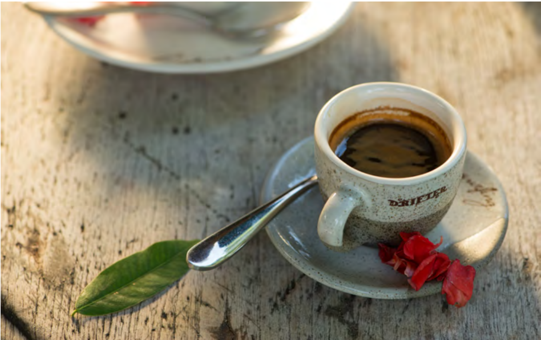
DRIFTER SURF CAFE - BALI