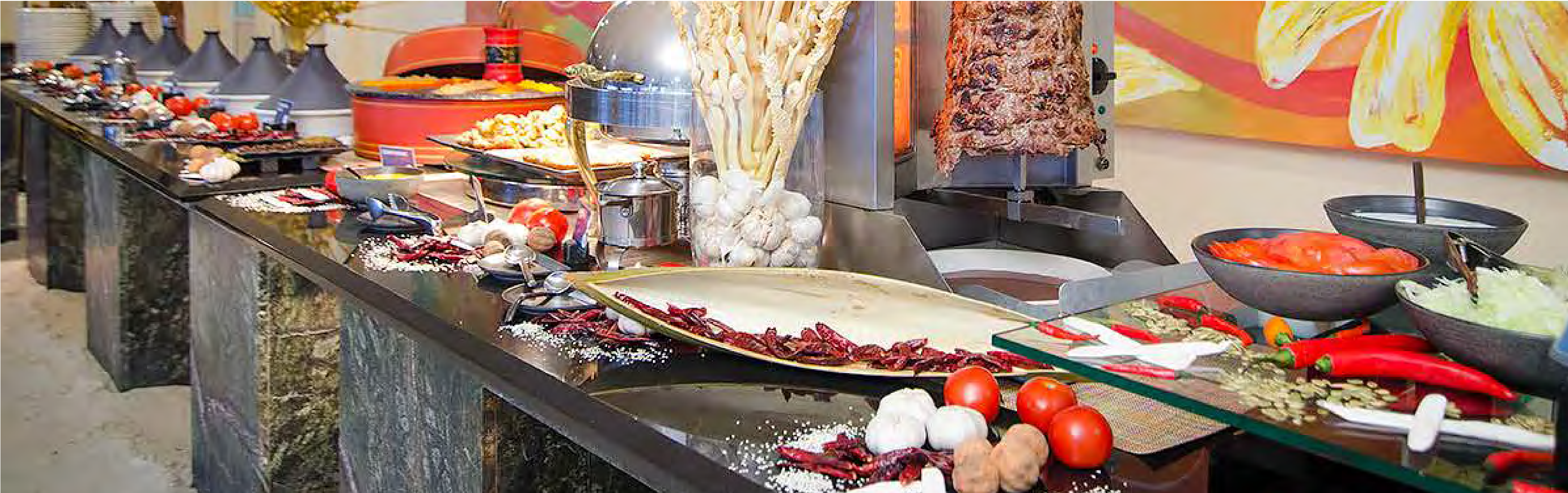
MIRIHI ISLAND RESORT - MALDIVES