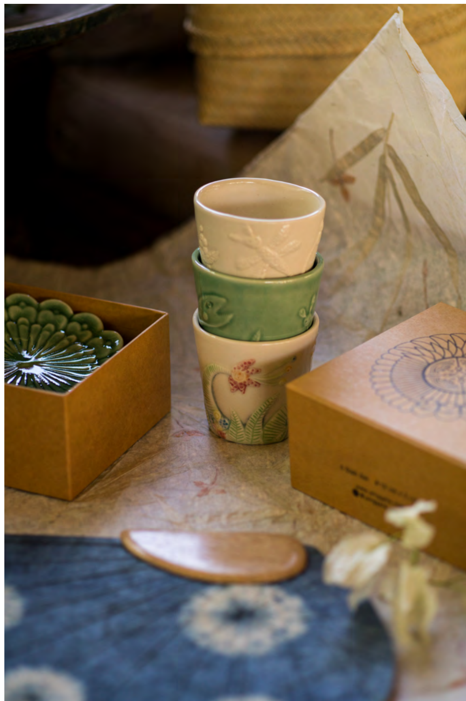
JENGGALA x TOMOKO KONNO COLLECTION