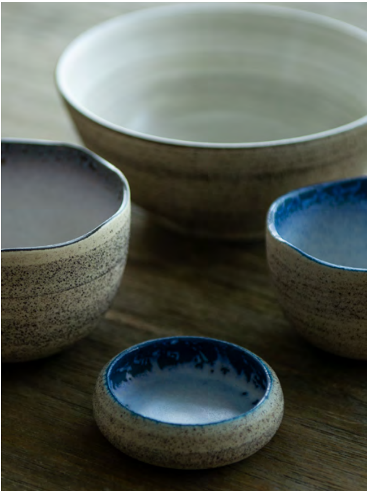
THE SHORE RESTAURANT AT HILTON BALI RESORT - BALI