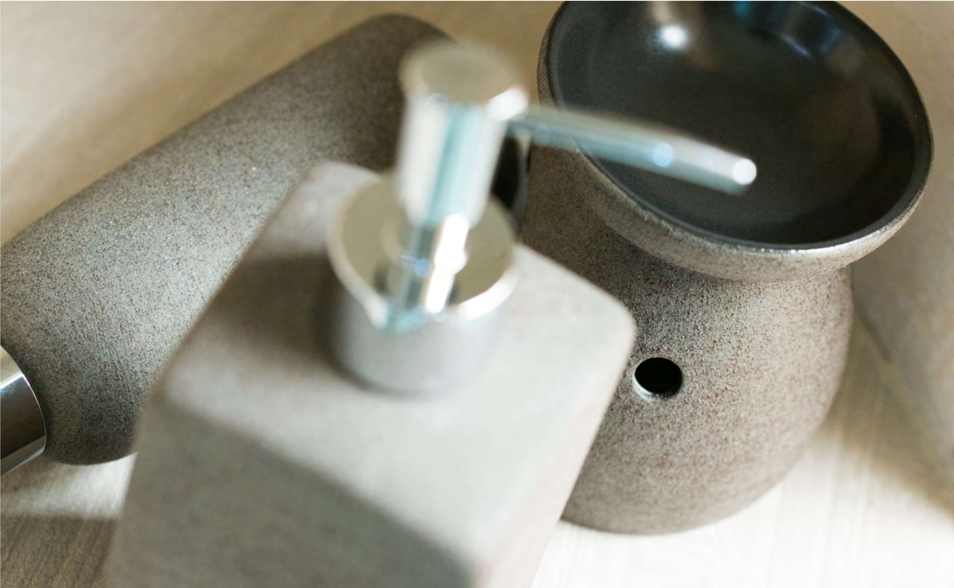
BATHROOM AND SPA COLLECTION