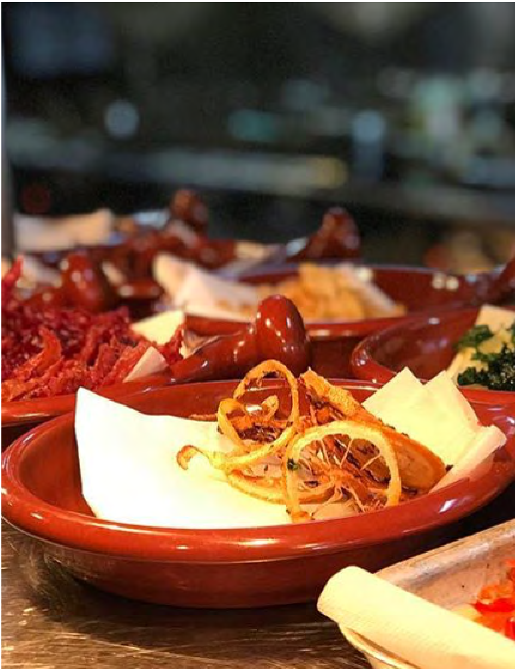
JAMIE'S ITALIAN - BALI