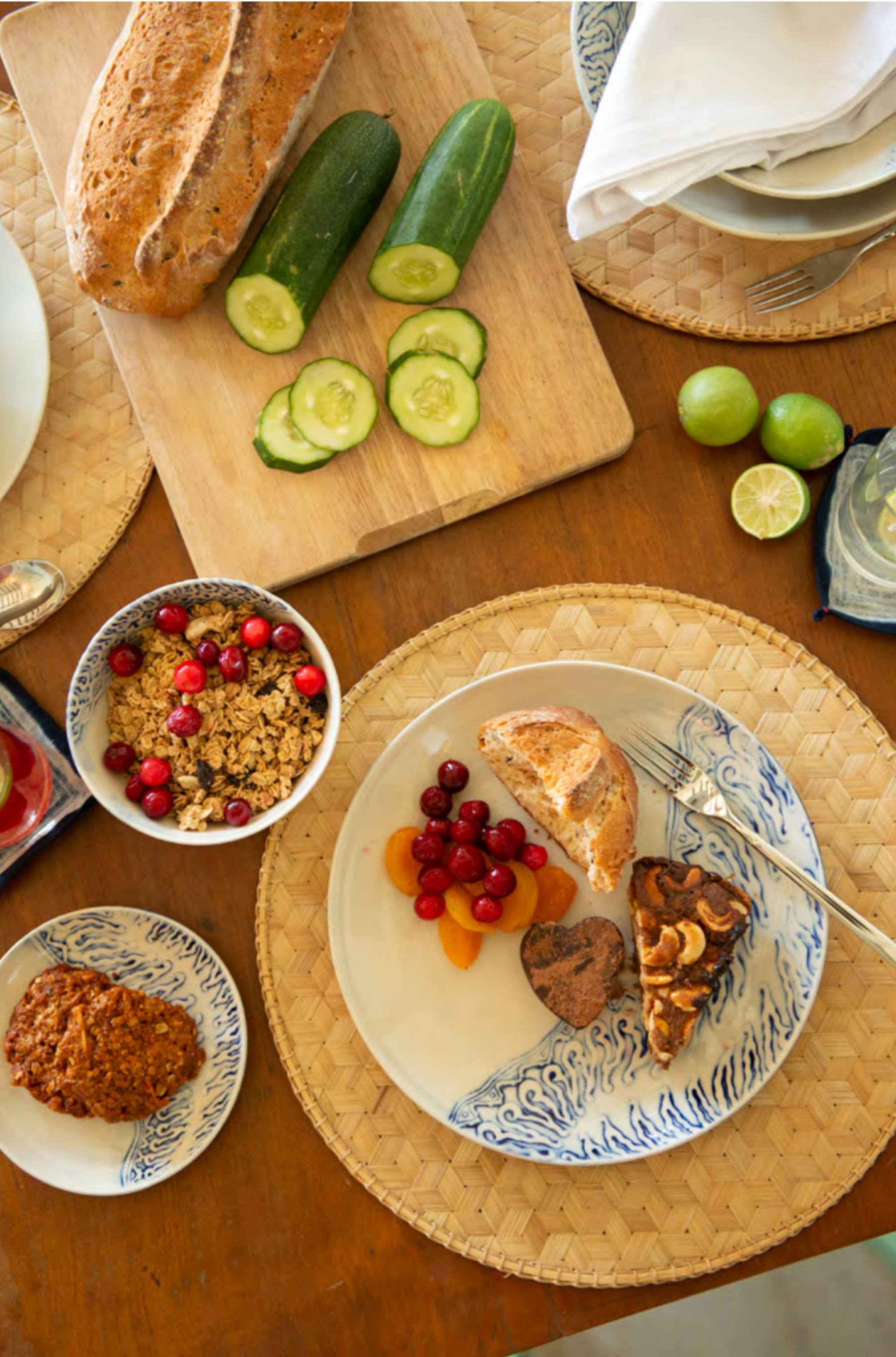
BATIK PARANG COLLECTION