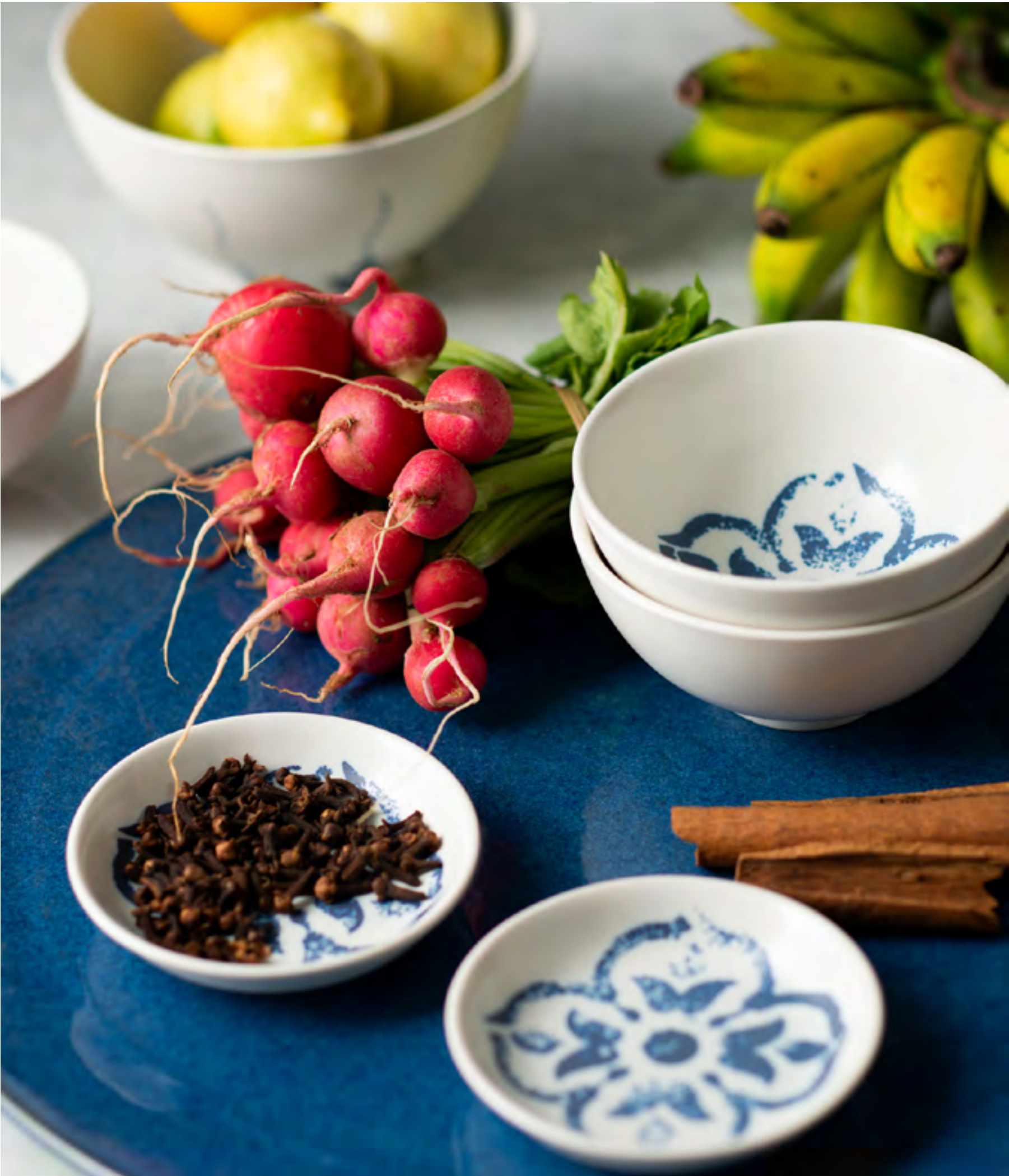
FLORAL INDIGO COLLECTION