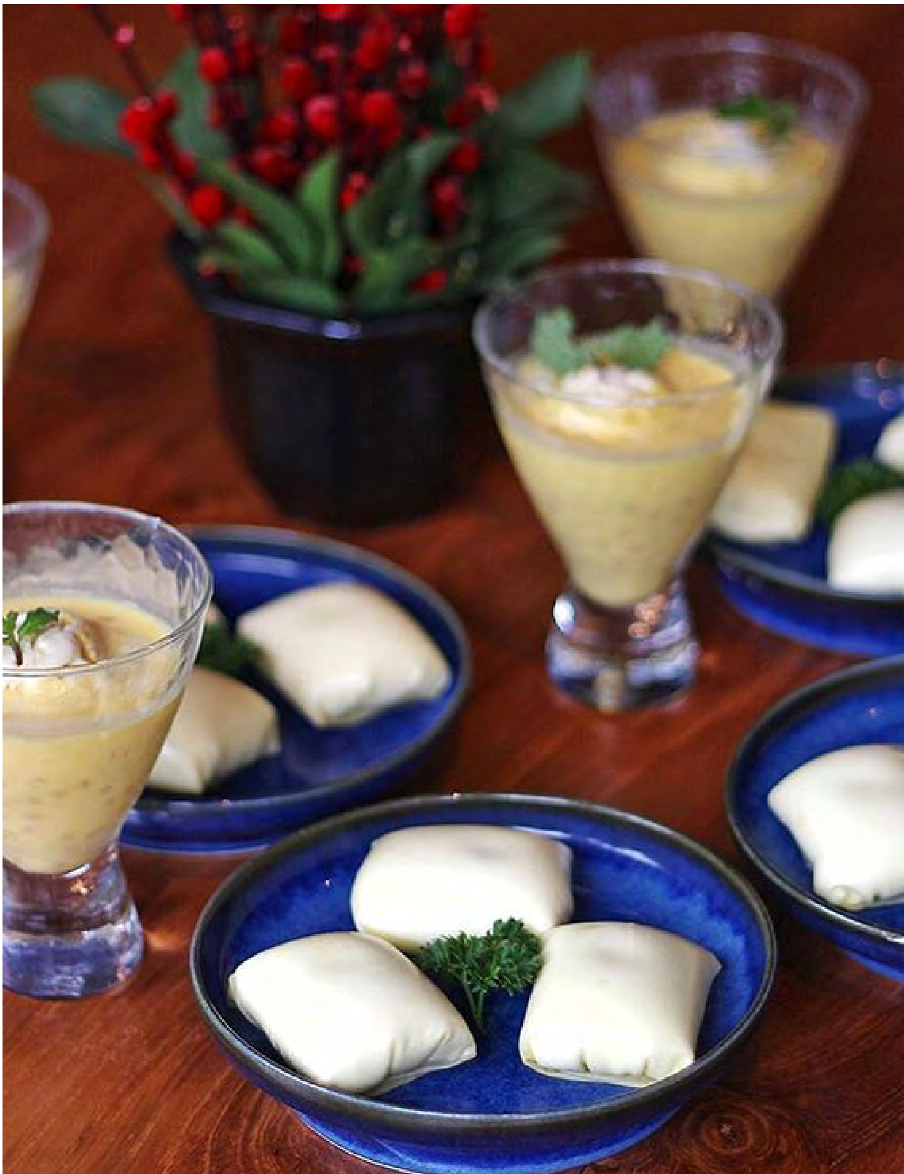
JIA RESTAURANT AT SHANGRI-LA HOTEL JAKARTA