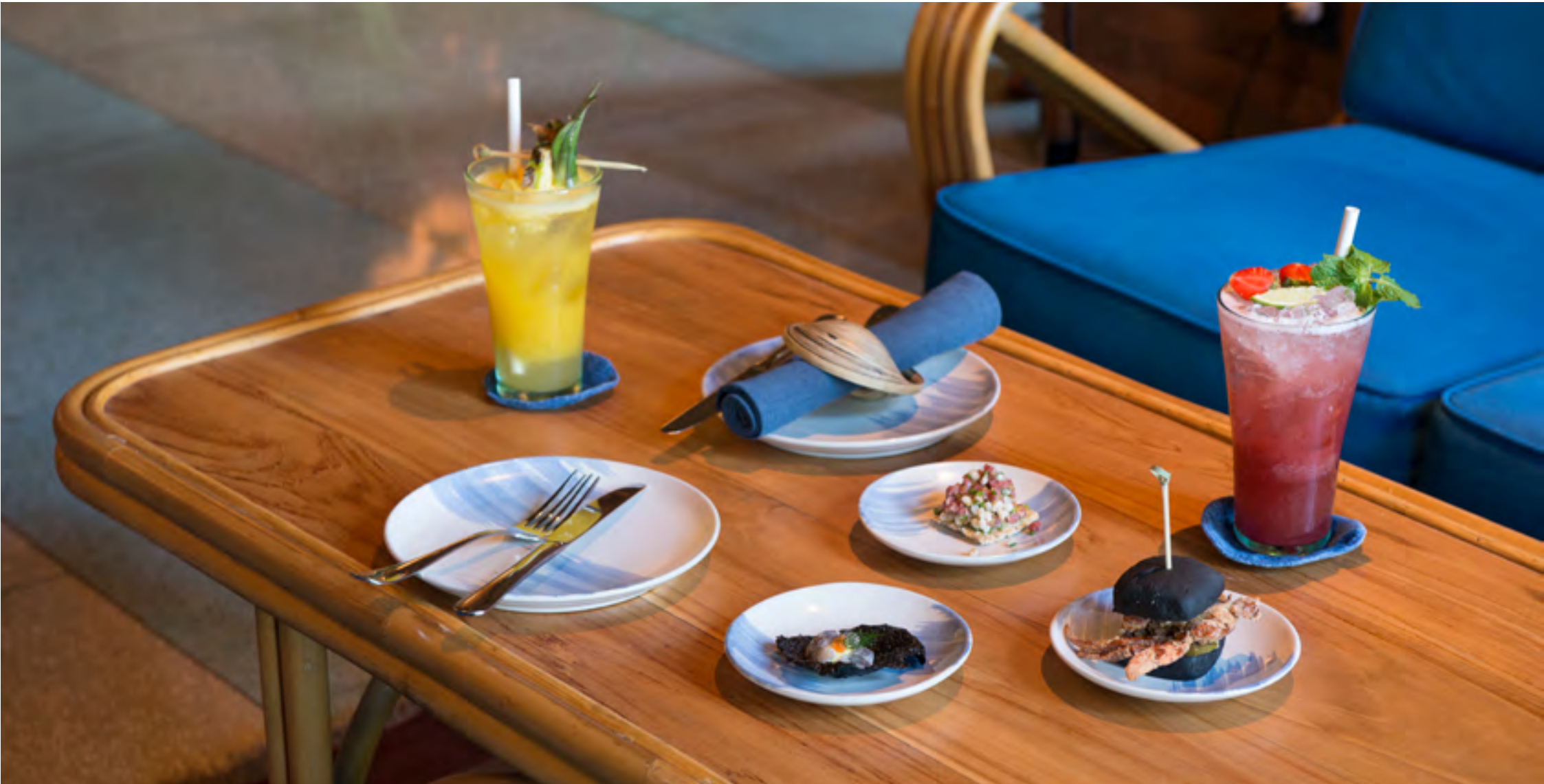
KATAMAMA HOTEL - BALI