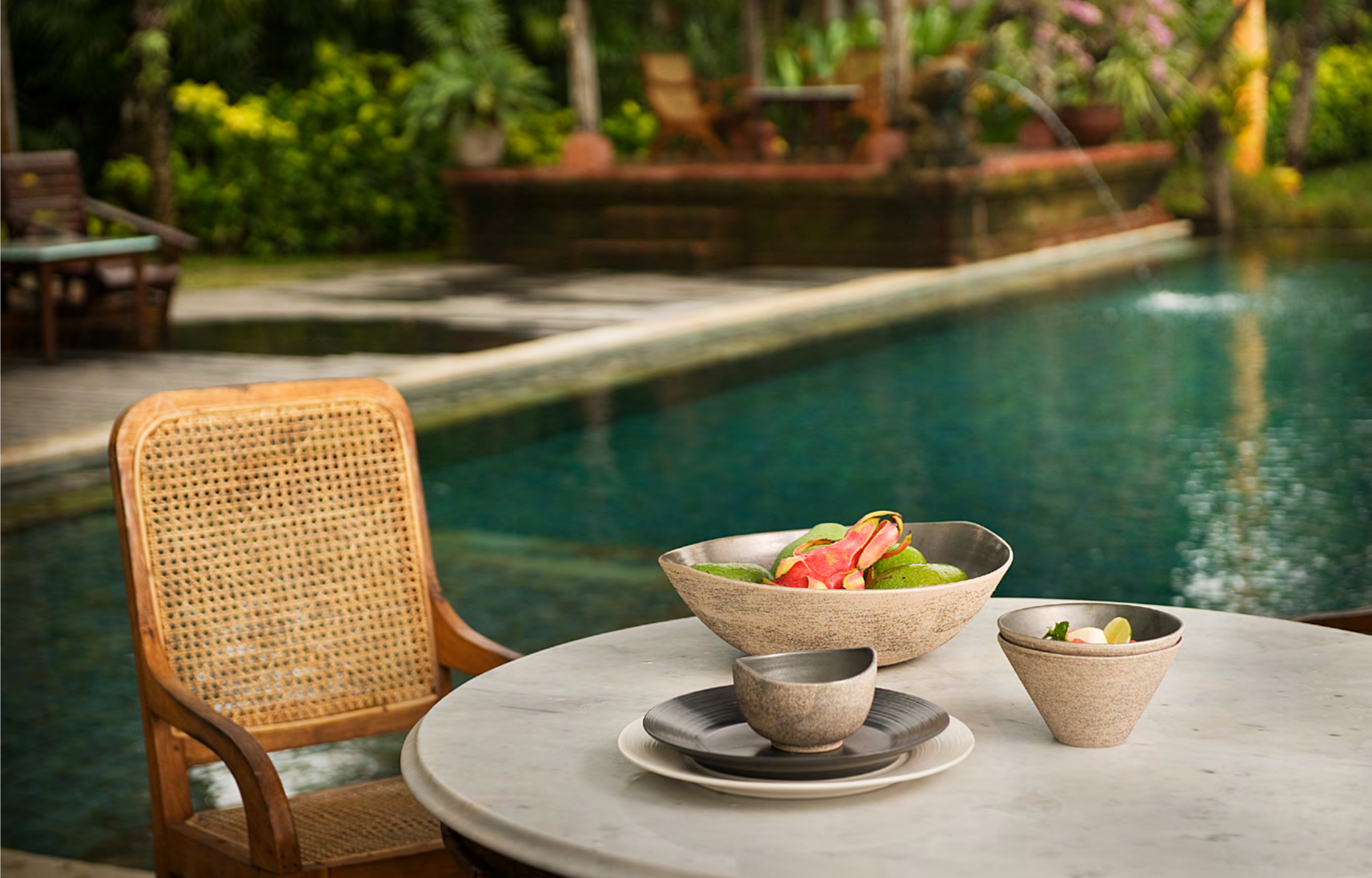
THE CHEDI - OMAN