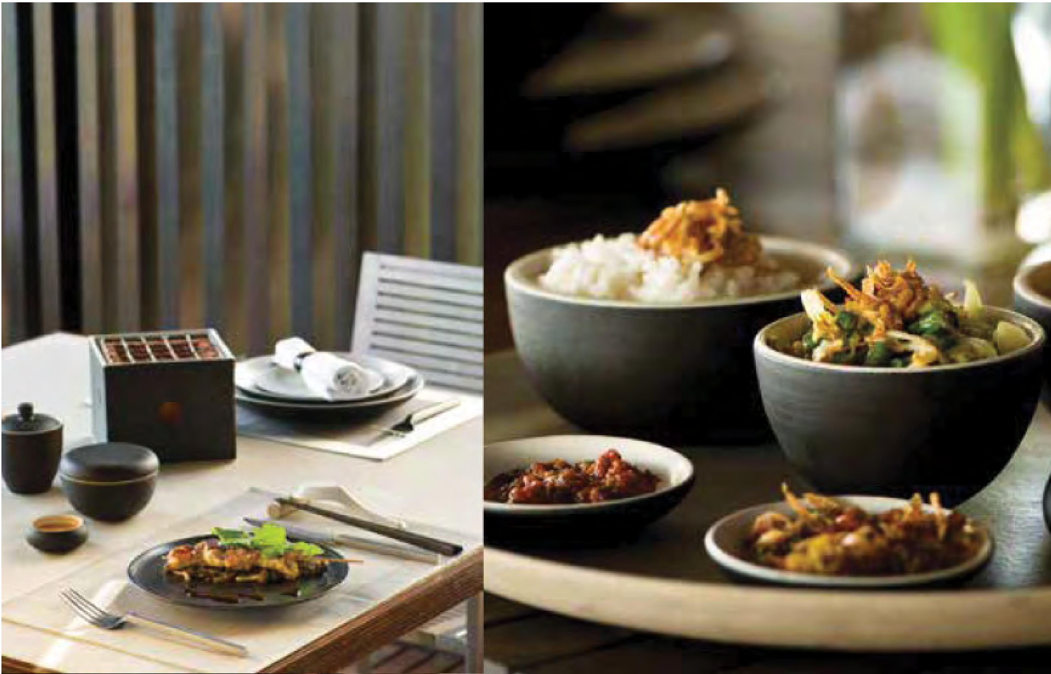
ALILA SOORI - BALI