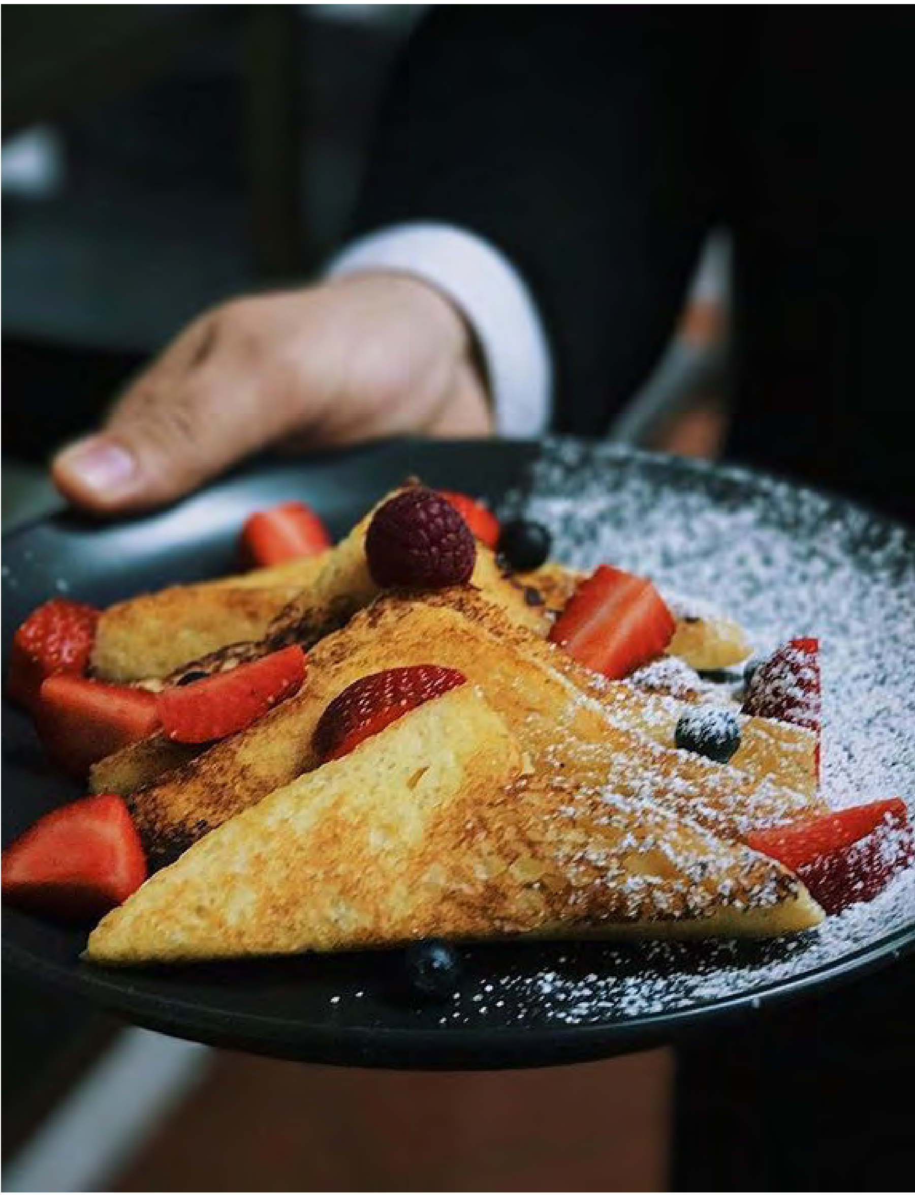
BAKEMART GOURMET - DUBAI