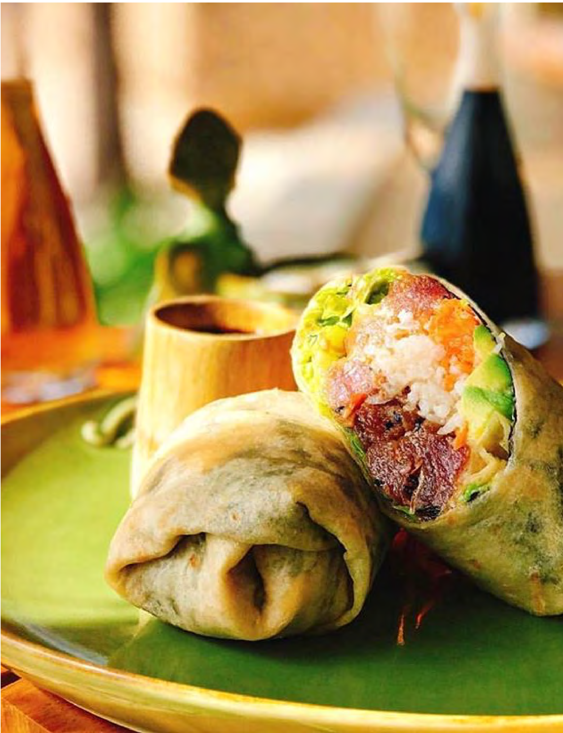
NIHISUMBA - SUMBA