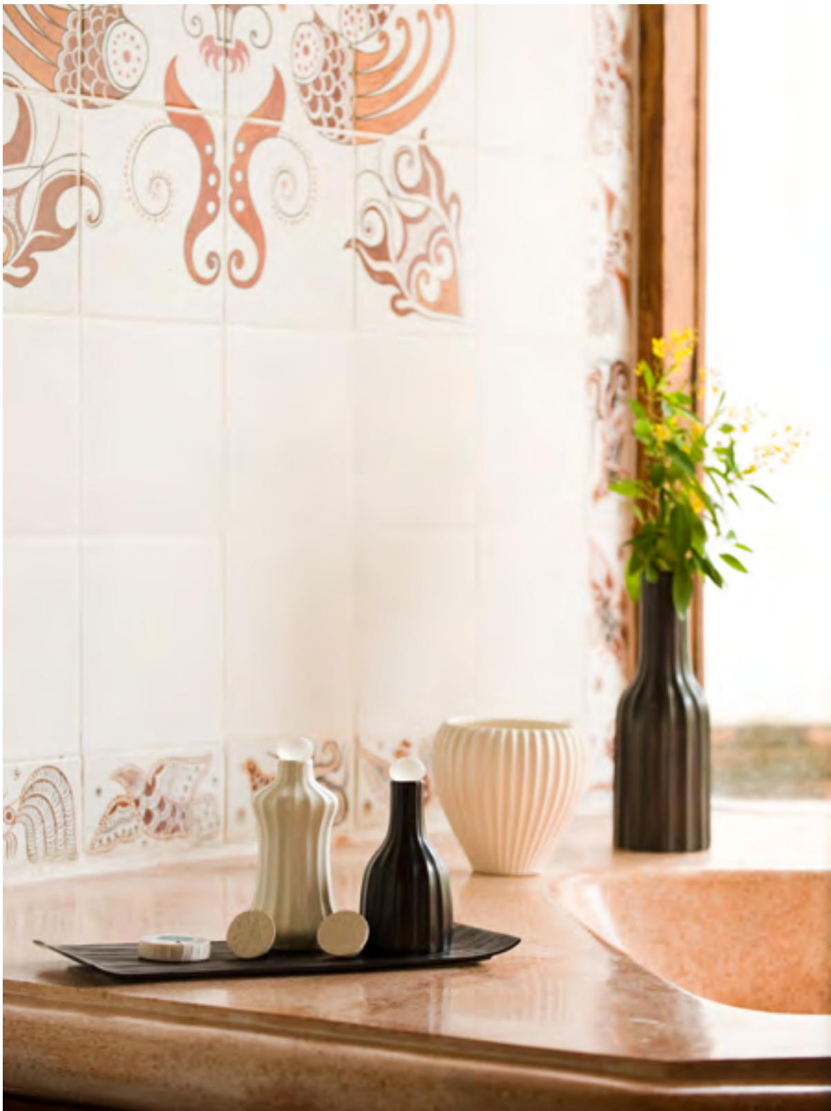
TANDJUNG SARI HOTEL - BALI