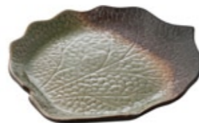
Big Square Plate RO1578 DIA 22.5x2.5 cm