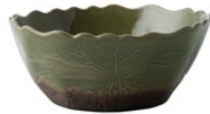
Lotus Leaf Big Bowl HB0597 22.5x15.5x3 cm