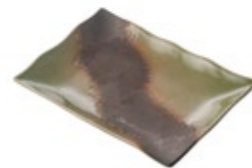
Oblong Plate RO1584 22.5x15.5x3 cm