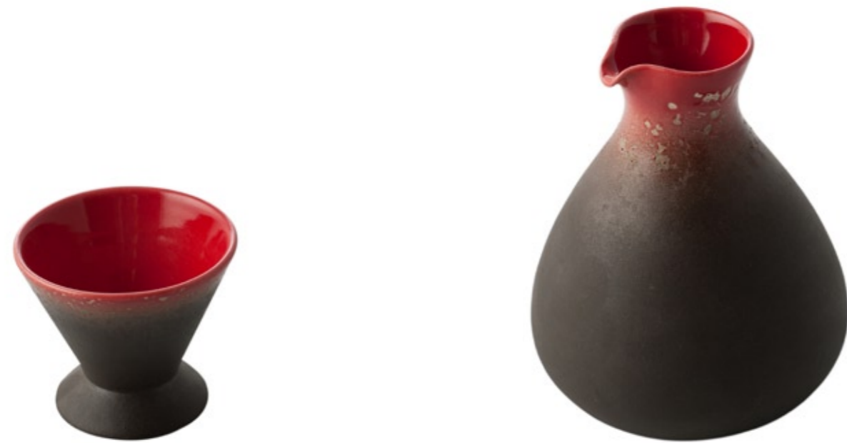
Sake Cup HI0042 DIA 6,5x6 cm