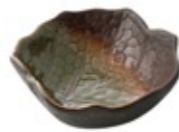
Ice Cream Leaf Bowl RO1581 DIA 14x13x4.5 cm