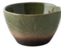
Tomyam Bowl Lotus RO1577 DIA 15x7.5 cm