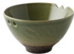
Lotus Leaf Noodle Bowl HB0596 DIA 17.5x9 cm