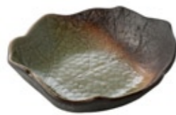
Leaf Bowl RO1580 DIA 19x17.5x5 cm