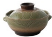
Lotus Curry Bowl HB0554 DIA 13.5x5.5 cm