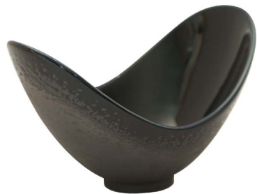
Small Una Bowl HB0355 DIA 17 x 12 cm