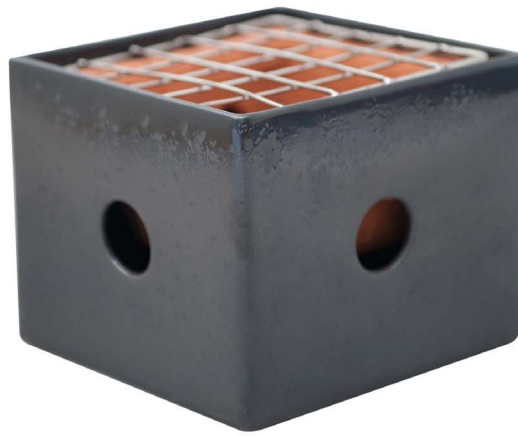
Sate Grill CO0959 15 x 15 x 12.5 cm