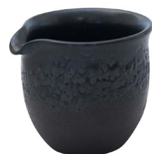
Creamer HR0009 DIA 6.2 x 6.2 cm