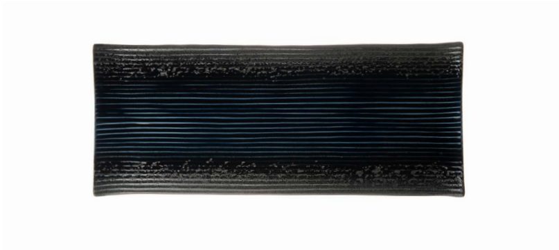
Rectangular Plate w/ Lines Motif RO1663 34.5 x 14.5 x 2 cm