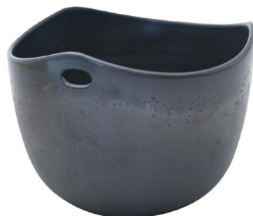
Noodle Bowl HB0622 DIA 15 x 11 cm