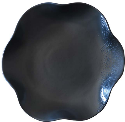
Plate RO2223 DIA 26 x 4 cm