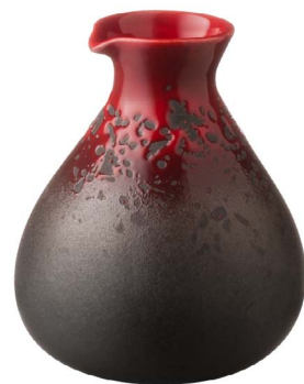
Soya Bottle CO2621 DIA 5.5 x 10 cm