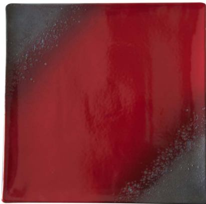
Square Plate RO1064 28 x 28 x 2 cm