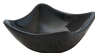
Olive Oil Dish RO1447 8 x 8 x 3.5 cm