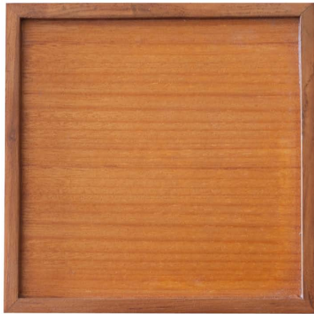
Wooden Base for Sate Grill WT0105 17 x 17 x 2 cm