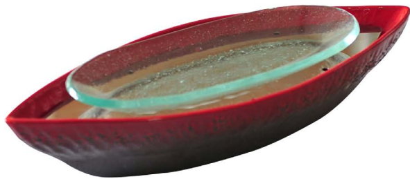
Hammer Boat Bowl CO2620 DIA 35 x 7 cm