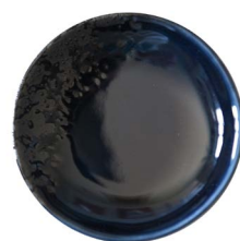
Butter/Ramikin Dish RO0561 DIA 8 x 2 cm