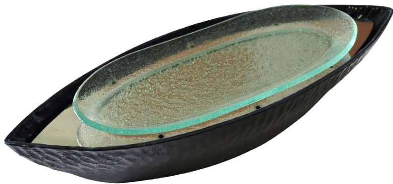
Hammer Boat Bowl CO2619 DIA 50 x 10 cm