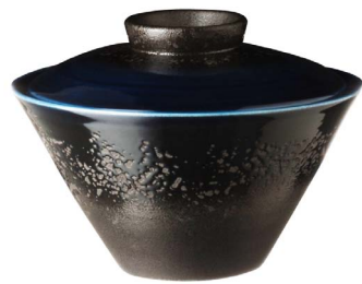
Covered Angled Bowl HB0874 DIA 14.5 x 8 cm