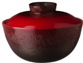
Covered Soup Bowl HB0877 DIA 14.5 x 7 cm