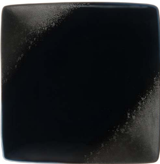
Square Plate RO1321 20 x 20 x 2.5 cm