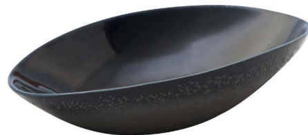
Small Egg Bowl RO1151 DIA 25 x 4 cm