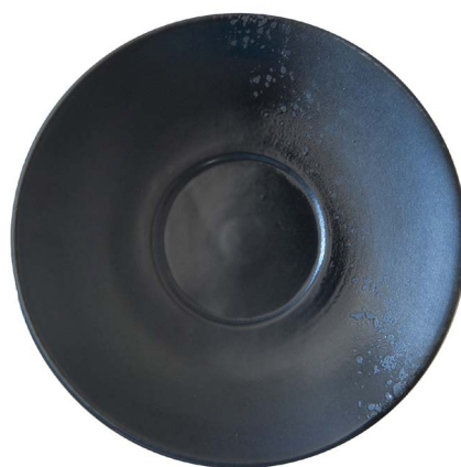
Saucer RO1286 DIA 17.2 x 2 cm